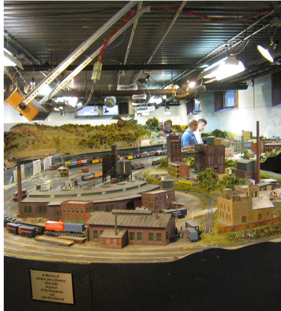
A Visit to the Quincy Society of Model Engineers