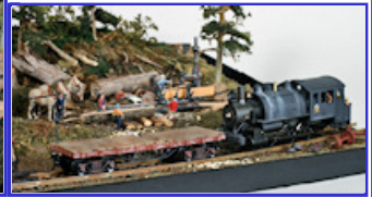
Diorama Second Place 2009 Tom Trotter