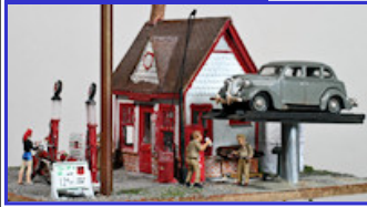
Phillips 66 Gas Station Model