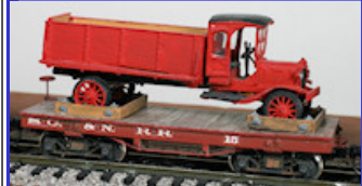
Whole Train First Place 2009 Dave Roeder