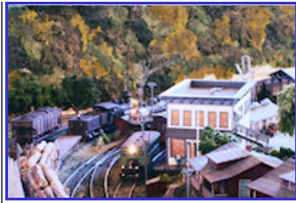
Swandale, WV in Summer