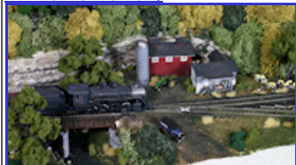
WV with Barn & Dairy