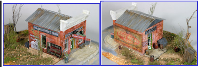
Offline Structures First Place 2009 Greg Gray