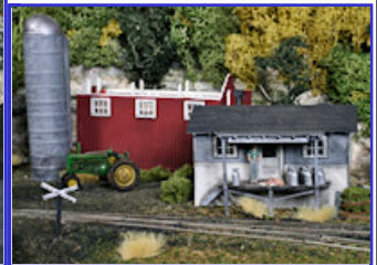
Best in Show Phil Bonzon