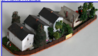
of Acme Avenue