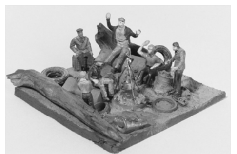
Learn how to design and paint model figure scenes like this one created by Rich Laux.

Sunday, December 15, 2-4pm Painting Model Figures and setting the scene, by Rich Laux