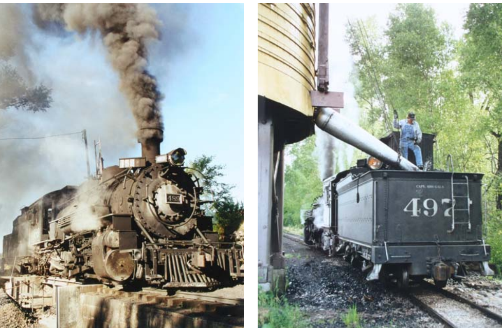
B&W Prototype Photo, 1<sup>st</sup> Place, Jeffrey Boock

Color Prototype Photo, 2<sup>nd</sup> Place, Jeffrey Boock