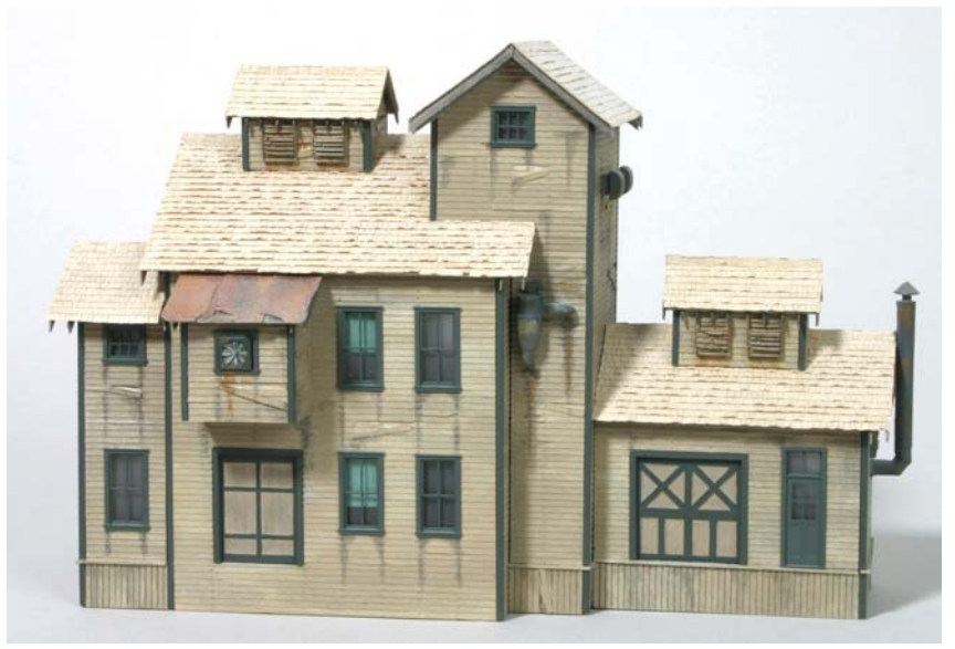
B&W Model Photo, 1<sup>st</sup> Place, Jeffrey Boock

Off-Line Structures, Honorable Mention, Jeffrey Boock