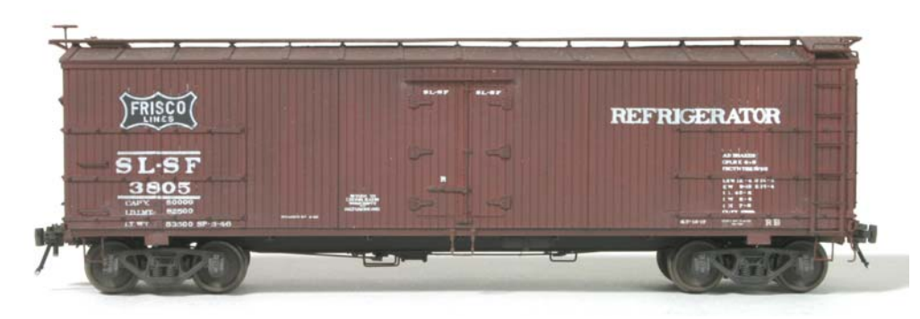
Freight Cars, 2<sup>nd</sup> Place, Brad Slone