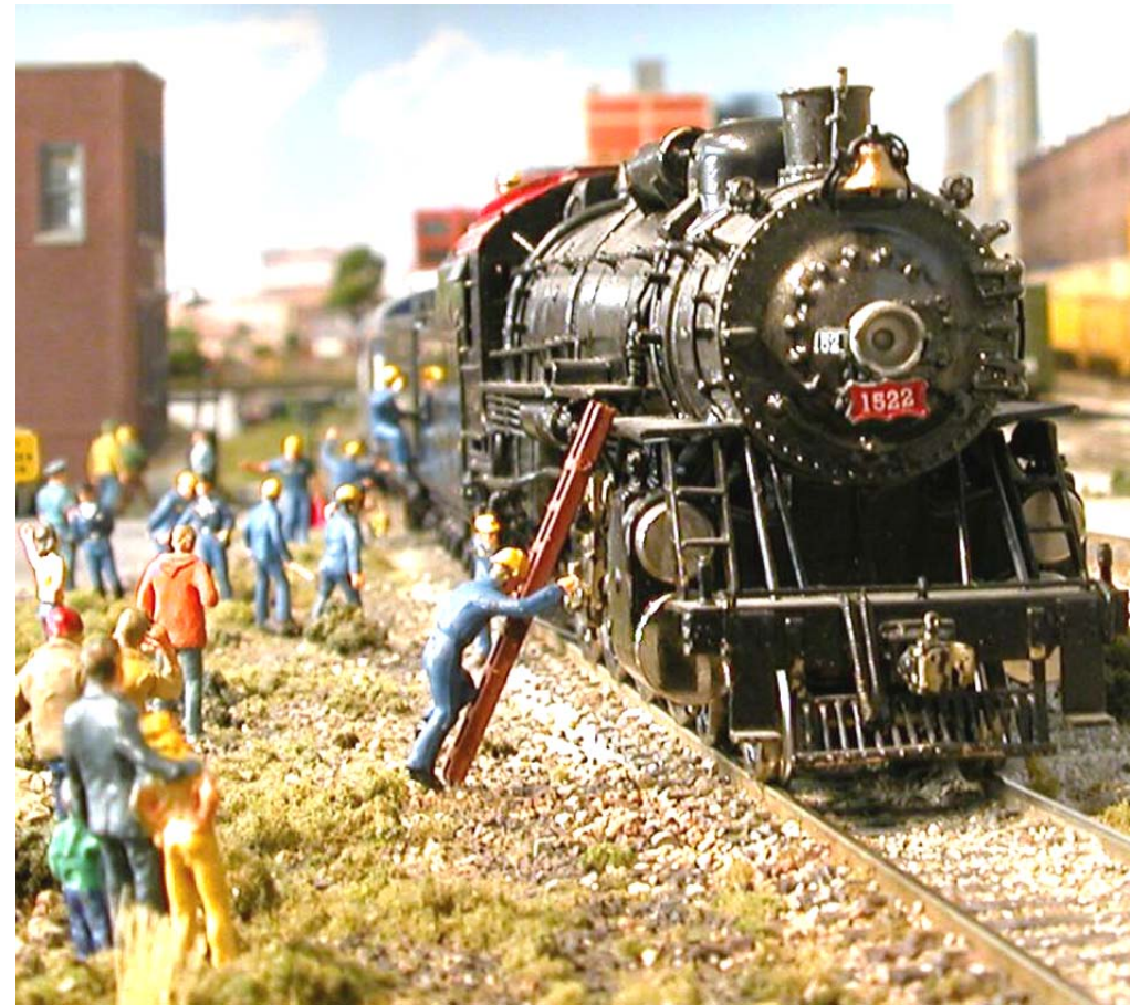
Frisco 1522 at a service stop on Dave Roeder's WG&F