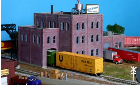
The cabinet factory siding runs right through the building to provide weatherprotected unloading of wood and other raw materials.