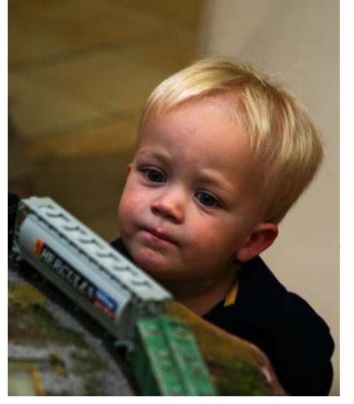
such as Chesterfield Mall and West County Mall, as well. The project layout always catches children's attention at

in a new effort to spread the word about model railroading more widely, it has been displayed at area shopping malls,