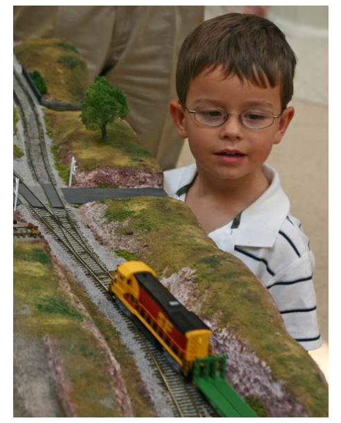
The other siding in this corner of the layout is the team track. The dock, office, and even the overhead crane were all put together out of Boedges' scrap box.