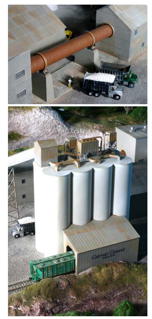
The elaborate cement distribution system at the top of the storage silos is especially well modeled.