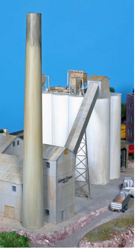
The stack and conveyor add a strong vertical element not often seen in small portable layouts. The heart of a cement plant is the rotary kiln, an enormous, rotating steel pipe in which crushed limestone is sintered to form cement.

The largest industry on the layout is a Walthers Cornerstone Series 'Valley Cement' plant, with process buildings, rotary kiln, storage silos, covered loading, conveyors, and smoke stack.