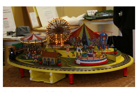
A circus-themed display layout