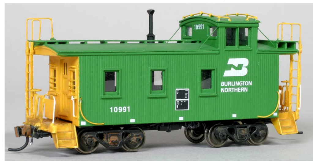
First Place, Cabooses: Dave Roeder, MMR – Burlington Northern Wood Caboose