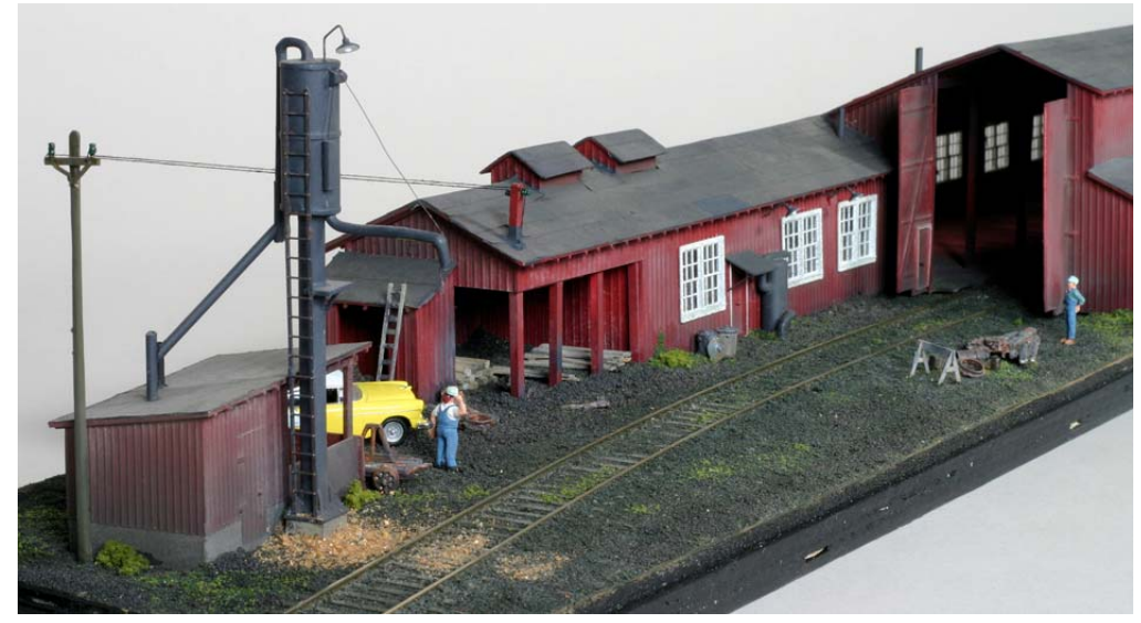
First Place, Online Structures: Phil Bonzon – Wood Engine House