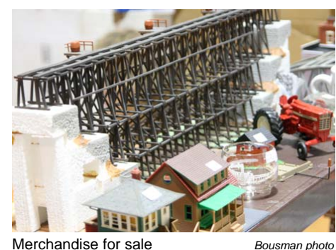
Merchandise for sale