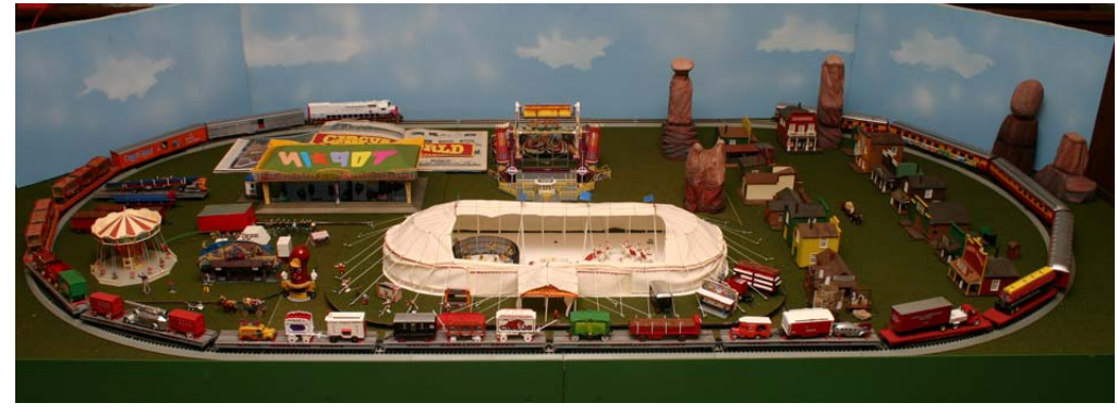
Another, larger circus themed display layout