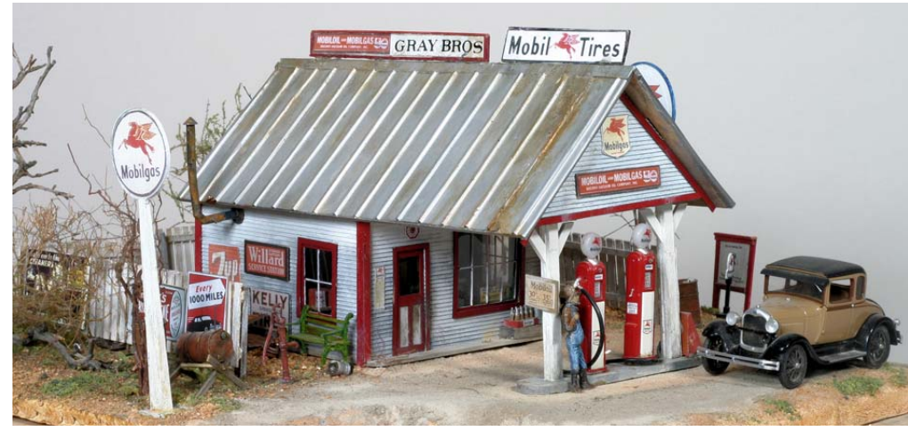
First Place, Offline Structures: Greg Gray – Gray Bros. Mobil Station Best in Show