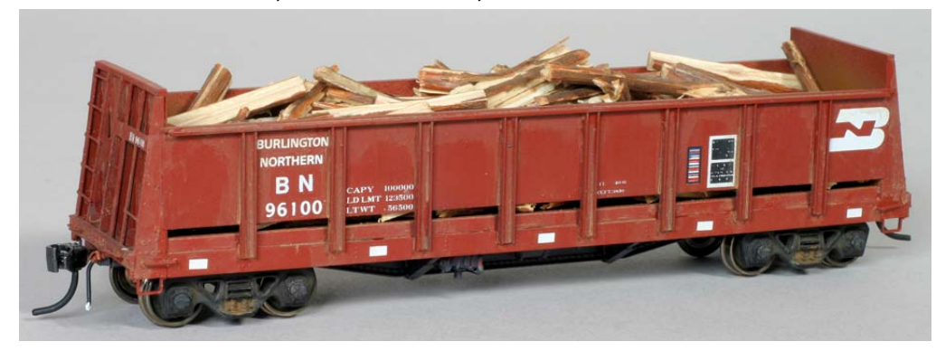
First Place, Freight Cars: Dave Roeder, MMR – Burlinton Northern Pulpwood Car