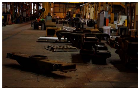
The tour was over at 12:30 PM and we thanked Dennis and Bill for their time and patience. Apologies were accepted for us being forgotten, as we were able to salvage a great tour.

Of course, it was very quiet as we went through the buildings but you can only imagine the nose level when everyone and every machine are working.