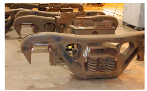
Many specialized pieces of machinery were present, from small to huge. We saw lathes, drill presses, tool grinders, hoists, milling machines, to name a few.

Every single part on a freight car gets inspected and repaired or replaced, if necessary. We saw knuckle couplers, lift bars, freight car trucks all apart, springs, grab irons, air hoses, sidepanels, you name it, it was there, all on the floor in an organized manner.