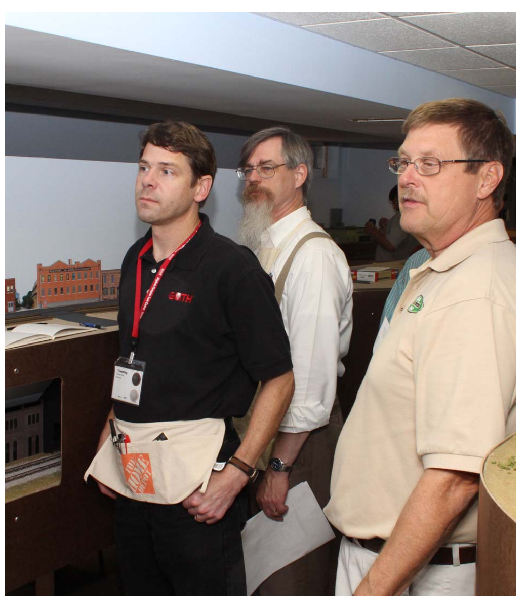
Gateway Division Rail Op Weekend 2010

Official Publication of the Gateway Division NMRA