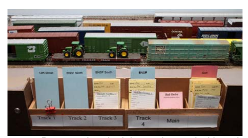
Paperwork - don't leave the yard without it