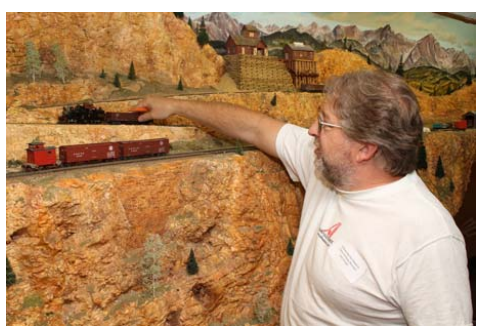
Sometimes a bit of re-railing is necessary