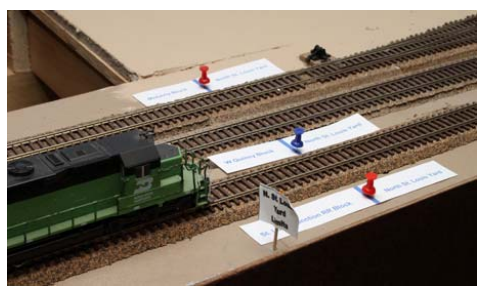
On a railroad as large as this one it helps to have yard limits and occupancy blocks clearly labeled for the train crews