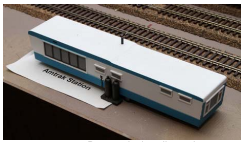
Prototypical realism, circa 1995.