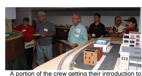
the St. Louis Junction Railroad and the numerous trains they'll be running for the next three hours.