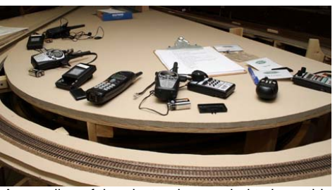
A sampling of the electronics needed to keep this 1500 square foot layout running and the dozen or so operators informed of one another's movements..