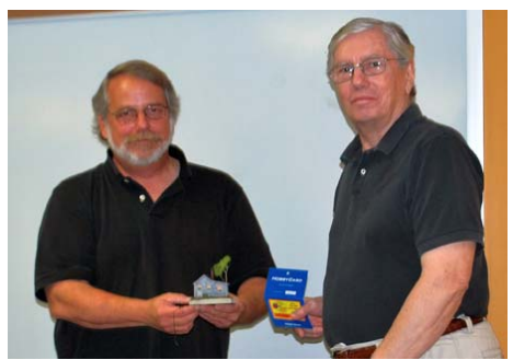
The house built by Phil Bonzon, MMR took 1<sup>st</sup> place.