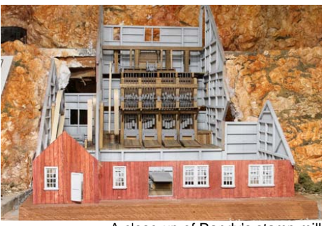
A close-up of Randy's stamp mill