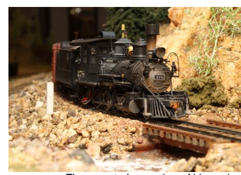
The operator's eye view of his engine