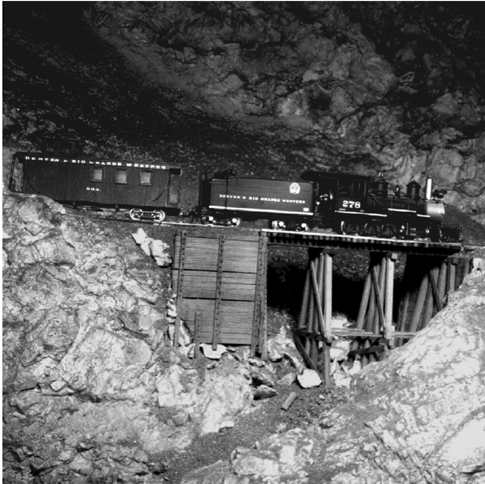
Gateway Division - Mid Continent Region - NMRA