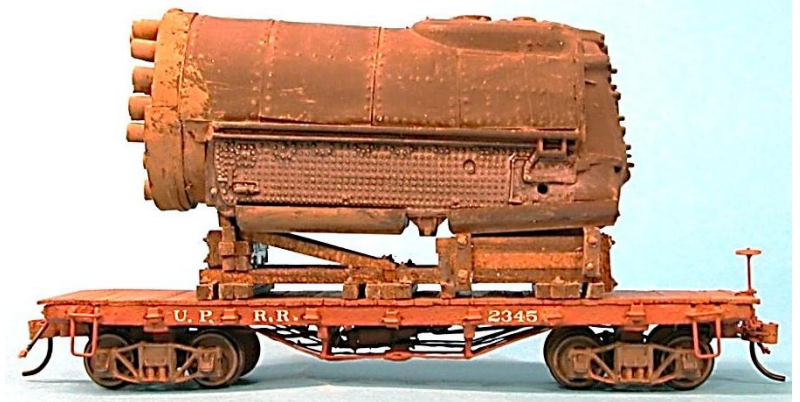
Volume 20, No. 1 — Spring 2012

equipped with hand brakes as early as 1845. Early freight cars were not equipped with brakes since most railroads considered this expense unnecessary. Life was cheap and safety was not on the