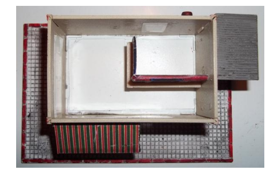
Interior of Dodo Burger

I cut a piece of 1/8" hardboard to the shape of the location and sprayed if gray in imitation of a concrete parking lot. Next, I located the where the building would stand and marked the base accordingly. I determined the location of the parking spaces required and cut white Trim Film into strips