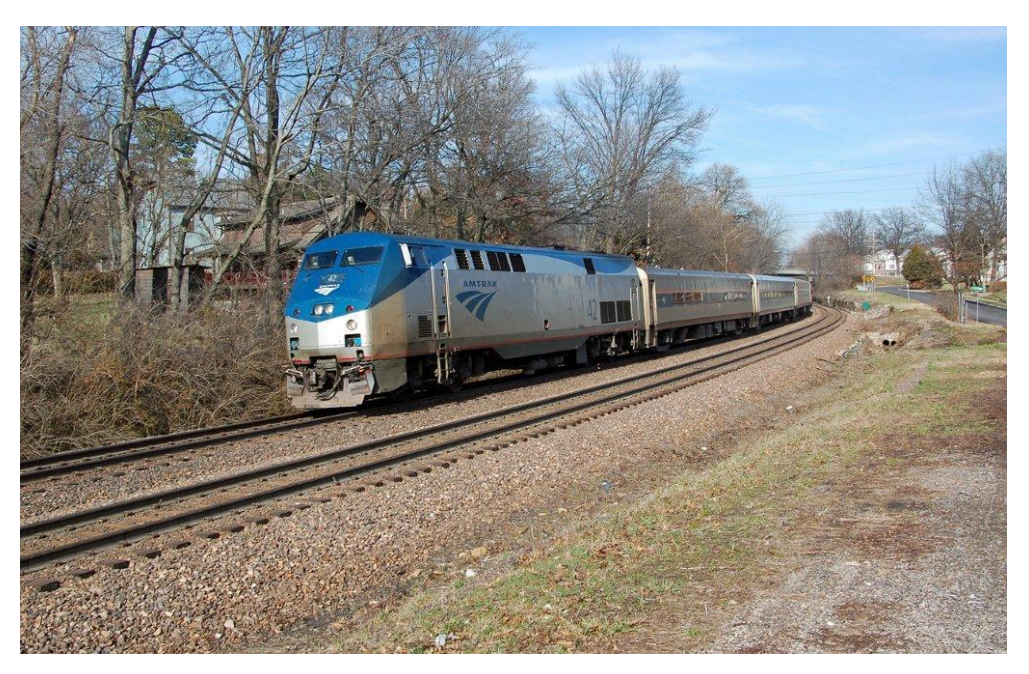
Westbound Amtrak at Geyer Road