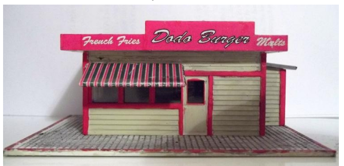
Front of Restaurant

measuring a scale three inches wide. These I applied using Champ Decalset. They broke up during the application, but fused back together with the application of the Decalset. I added pieces of sprue, measuring 0.010" in diameter, painted brown, as parking blocks to the two spaces needing them, which, according to my father who has memory for such details, were round