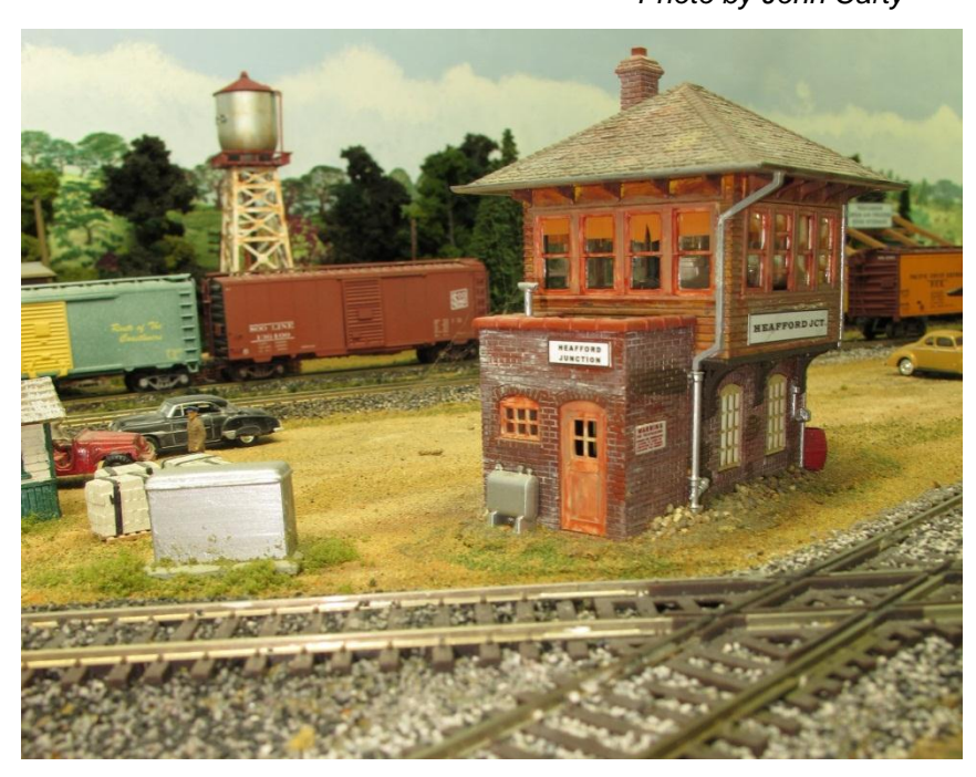
This photo was taken looking west toward the tower at Heafford Junction, Wisconsin. The track crossing represents the now long abandoned Milwaukee Road line running north into Michigan.