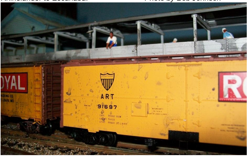
An ART refer waits as the crew at Ice House #3 at the National Stockyards prepares to add ice and salt for shipping beef on the Daylines.