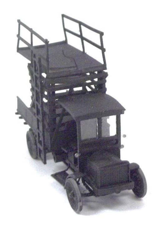
Finished model less additional details.

I fabricated a windshield frame from styrene and attached it to the cowl. I then added the roof to the top of the frame. Lastly I attached the bed to the back of the truck frame and the back of