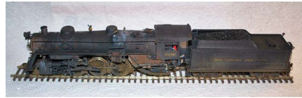
Third place in ScratchBuilt Steam Locomotive with 103 points.