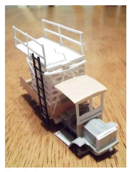
Model prior to painting.

smaller straight brackets and attached two of these brackets to the ends of each running board. I then affixed the running boards and fenders to the frame after removing the mount for the large tool box. I added pieces of strip styrene to the fenders to match the photograph. I added the control panel, gear shift, steering wheel, and cowl supports next, followed by the steering rod, brake rods, and muffler. Next I added a pair of pieces of styrene tubing to the passenger side of the frame to simulate the winches in the picture. I also assembled the tool