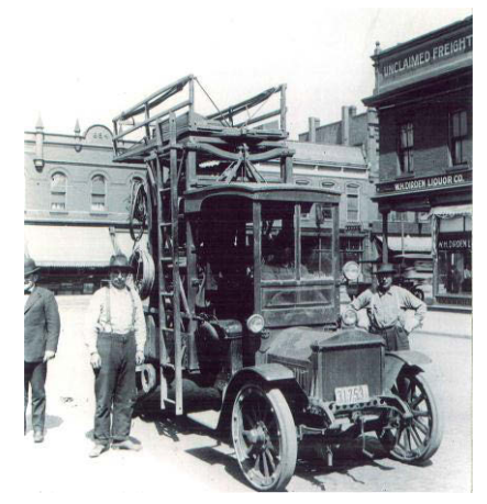
The prototype line truck.

I model the East St. Louis & Suburban Railway companies as they would have appeared had they survived into the 1950's. As a result street cars, interurban cars, and steeple cabs dominate my roster of motive power. Another aspect that makes interurban systems stand apart from steam roads stems from the types of maintenance of way equipment in use. The most notable piece of maintenance equipment peculiar to interurbans is the line car, which allows men to work on the overhead wires used by most interurban systems to provide