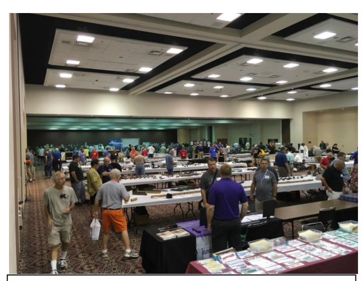
By 10:15 the crowd is flowing in and the tables are beginning to quickly fill up with a wide assortment of models

Activities began on Thursday evening at the Bandanas BBQ near the