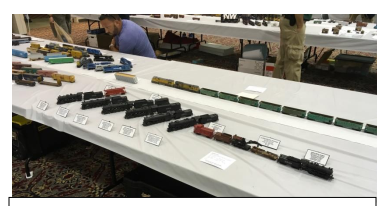
Don Morice of St. Louis provided a sampling of IC steam power as well as a few other treats.

While the vendors and exhibitors were busily setting up their areas, a handful of volunteers assisted in preparing the