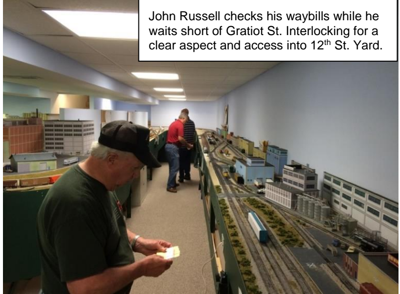
Railroad includes Digitrax DCC; DTC

each session in the intricate operations and wide isles. The model railroad is now 90% sceniced and has many large industrial structures. Super detailing and final adjustment to the signals are ongoing. For some older pictures