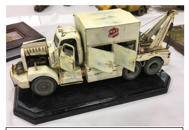
An example of an incredible scratch-built model on display by Steve Hurt of Columbus OH.

While the vendors and exhibitors were busily setting up their areas, a handful of volunteers assisted in preparing the