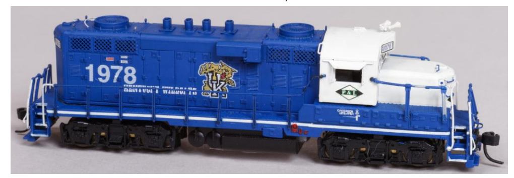
2<sup>nd</sup> Place Diesel Locomovite: Davenport #3, Dave Roeder