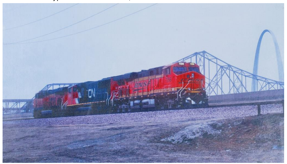
3<sup>rd</sup> Place Prototype Photo: IC in Snow, Steve Goaring