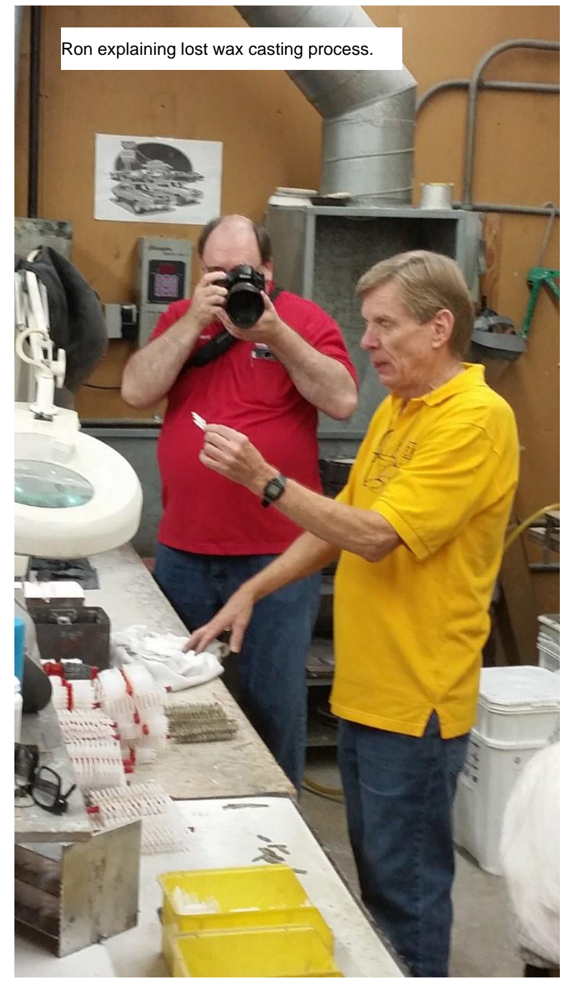
Volume 27, No. 4 - Winter 2020