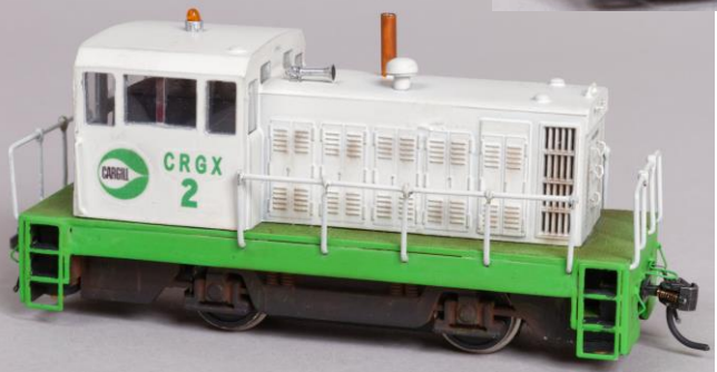
Volume 27, No. 4 — Winter 2020